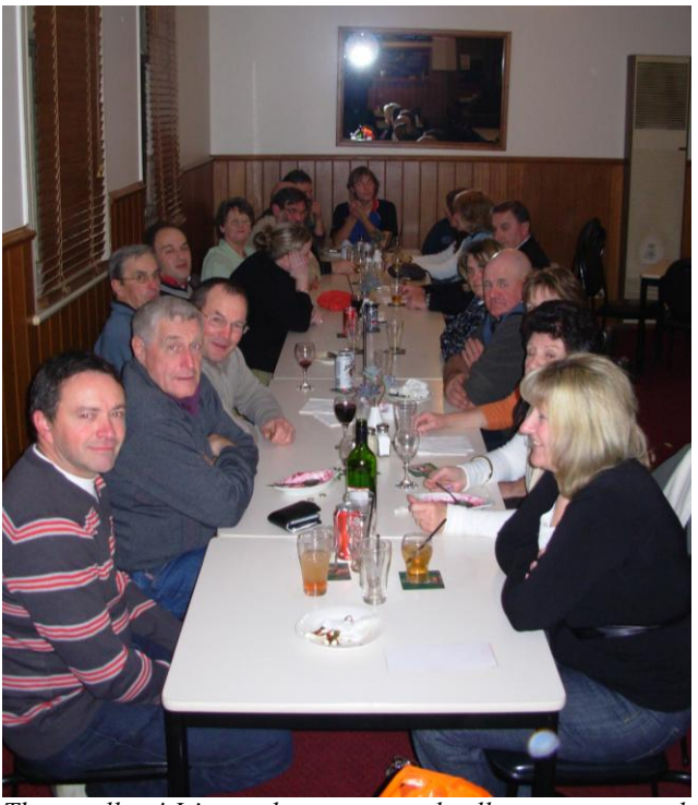
The revellers! It's good to see a good rollup at events such as these. It was certainly one of the better nights. The food at the Queens Head is most enjoyable and reasonably priced.

As everyone will be aware the BRMFC Xmas in July dinner was held at the Queens Head Hotel on the 24<sup>th</sup> July. It was great to see a strong turnout this year and I think that all who attended will agree that it was a good night out. As per usual the Queens Head put on a great value for money meal and even though the seating arrangements were slightly cramped, it was nice and cosy thus inviting everyone to join in on conversations and friendly banter.