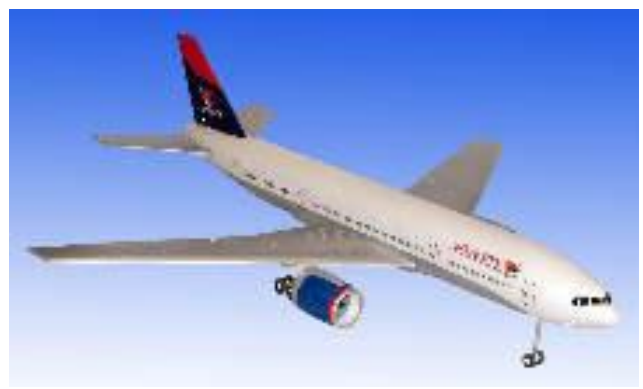
Boeing 777 Electric powered model by Super Flying Models

Contact: Roger Carrigg on 0437 842 277 or roger@startek.com.au and make an offer.