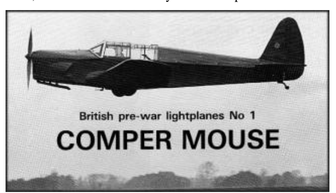
FLIGHT, SEPTEMBER 28, 193

For the last couple of months I have been looking for a subject to build for scale competitions, Noel came over one night and gave me a list of likely subjects, I had never heard of any of them. I don't know where he digs them up from, all of them obscure early 1930s aeroplanes.