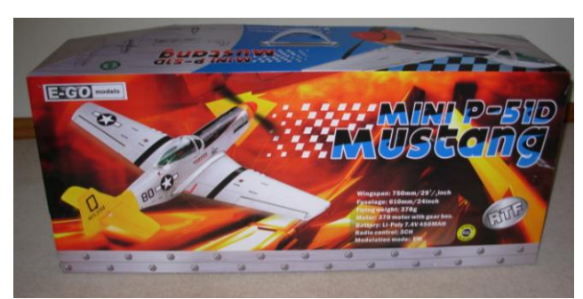
E-GO Models - Mini P51D Mustang RTF