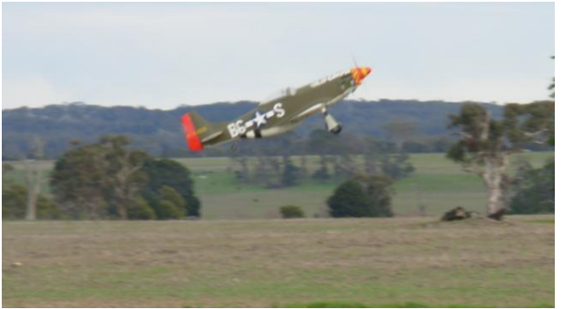
Russell Aggetts's P51 (Old Crow) on its inaugural flight moments after lift off.

The motor burst into life and the P51 tore down the runway leapt into the air captured in the photo below. Russell did a few minor trims and flew it around for several circuits. This is a large model and it looked good in the air. On a low slow pass over the runway the motor decided to stop. It all happened very quickly; with no motor and low airspeed it had the glide rate of a house brick. Descending rapidly it pan caked damaging the undercarriage. No doubt Russell will soon have it repaired and out for another flight.