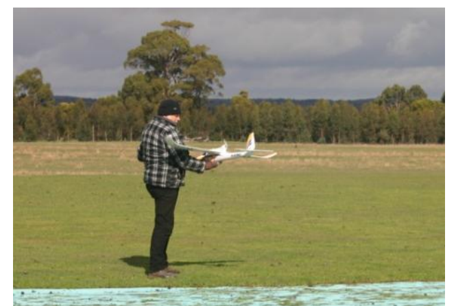
Len is retrieving the model after a successful flight. The visitors were overjoyed to see it fly the way it did.

Len flew several circuits until the battery was exhausted and brought it into land alongside the runway matting.