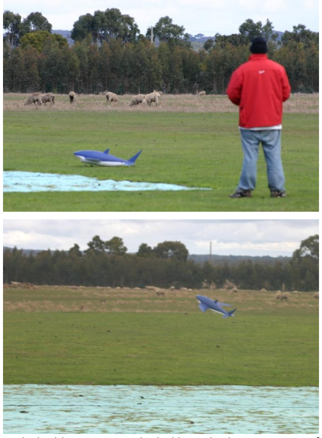
With the blue matting it looks like a shark jumping out of the water as it took off on the maiden flight.

On a lighter note and on the same day Doug Wallis came out with an electric foam model in the shape of a shark. Mat had the honour of doing a test flight. It flew okay but with the short wingspan it was generally laterally unstable making it touchy on the controls.