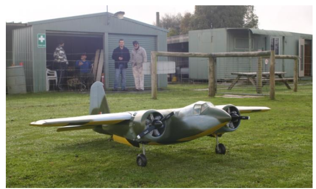
The dummy radial engine cylinders are quite effective and from a few feet look very realistic.

The Miles M.33 Monitor was a twin-engined British target tug aircraft designed and built by Miles Aircraft towards the end of the Second World War. Intended for use by the Royal Air Force and the Fleet Air Arm, the aircraft did not enter service with either. The Monitor came about as a response to Specification Q9/42 for a twin-engined highspeed target tug for the Royal Air Force. The specification called for a towing speed of not less than 300 mph (480 km/h) and an endurance of 3–4 hours. Two prototypes were ordered; the first prototype (Serial Number NF900 ) first flew on 5 April 1944, and was capable of reaching 360 mph (580 km/h). ( Courtesy <u>Wikipedia</u> )