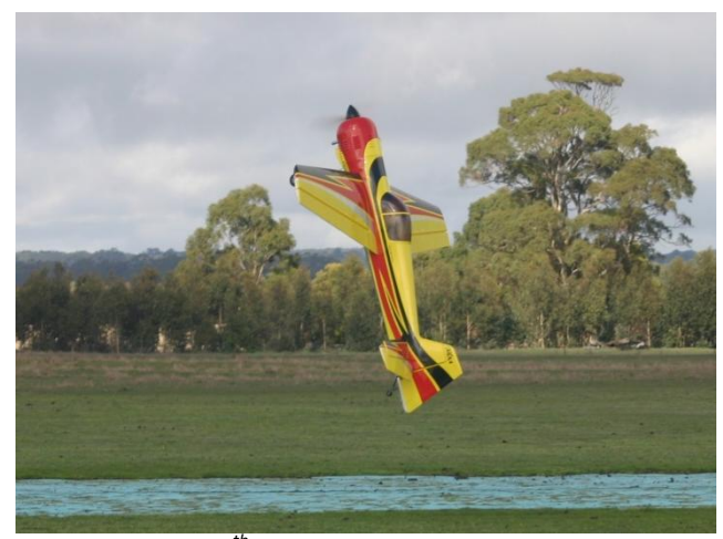
Sunday August 12<sup>th</sup> turned out good flying weather after the rain passed mid morning. Mat couldn't resist a bit of 3D flying.

took these shots of Mat's YAK 55 with an old Canon 300D SLR camera that I'm trying out. It's only 6.3MP but with 75-300mm lens it manages to capture a good close up shot. I'm looking at getting a new camera and working out whether I can be bothered with changing lenses. Certainly can't get shots like these with a compact camera.