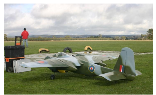
As you can see it's quite a large model and tips the scales at over 12kg.

John had the model out at the field on Sunday 12<sup>th</sup> August to run the motors up and see if any problems arise. From what I saw, the two OS 110's ran quite well and should have ample power and reliability. Rigorous checking of the CofG is required before the test flight. Unfortunately getting an accurate determination of the CofG on large models can be deceptive with disastrous results.