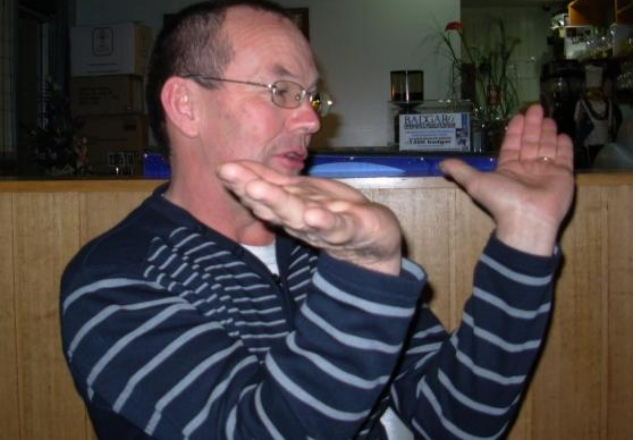
Sounds like bulltish to me Max!!!