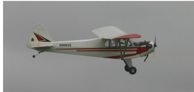
Doug's J3 Cub looks the part in the air that's for sure!

After several circuits Nick brought it in for a text book landing – nose, wingtip, tail, no I'm only joking!!! I think some adjustments to control throws were made before the next flight/s which also went well.