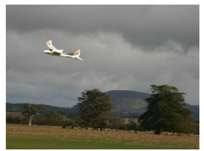
The white model looks quite effective against the grey sky with Mt Buninyong in the background.

Anyway Tim Carter took hold of the situation and reassembled the model making a few necessary modifications to get them back on the right track.