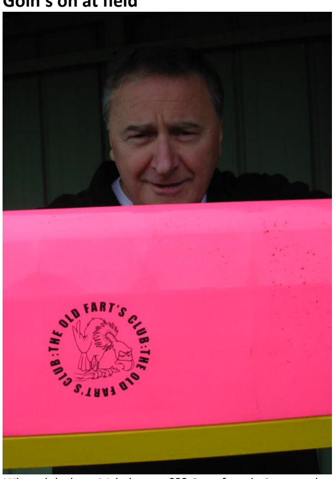
What club does A1 belong to??? Be a foundation member I'd say.