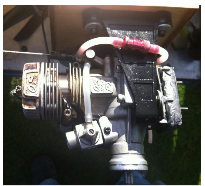
The old OS91FX; showing catastrophic failure of the crankcase.