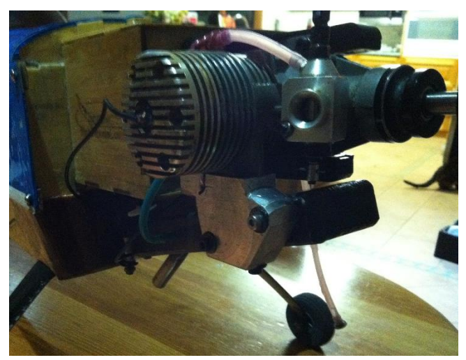
The new GMS 120; showing the new aluminium adapter and the old steel muffler.

Luckily I had picked up a used GMS120 2 stroke a while ago from Hugh's estate sale. I'd considered putting it in the Edge when I first got it but the OS91 had enough power and was very reliable. Also the GMS has a very mixed reputation for reliability; lots of people hate them. When I realised it was the same weight as the 91 and nose weight combined it seemed like fate so in it went. Funnily enough this Chinese motor was "inspired" by the Austrian Webra 120 that is fitted in the Pitts.