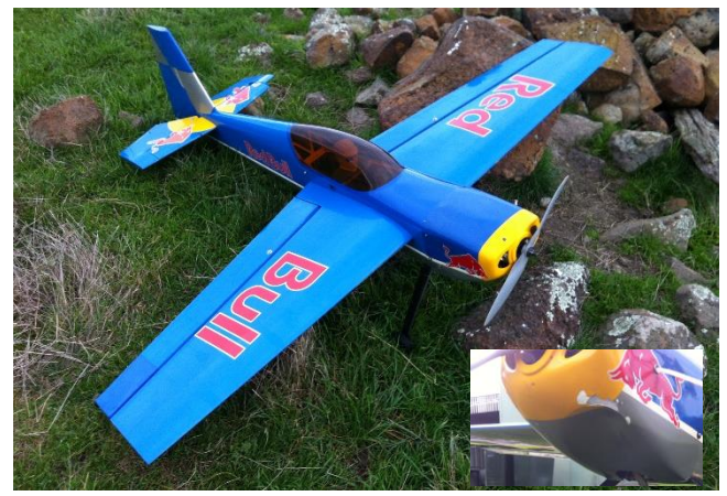
Scotch on the rocks is enjoyable, not Edge on the rocks though!!!

Again I was very lucky; bad luck hitting the rocks, good luck with the amount of damage.