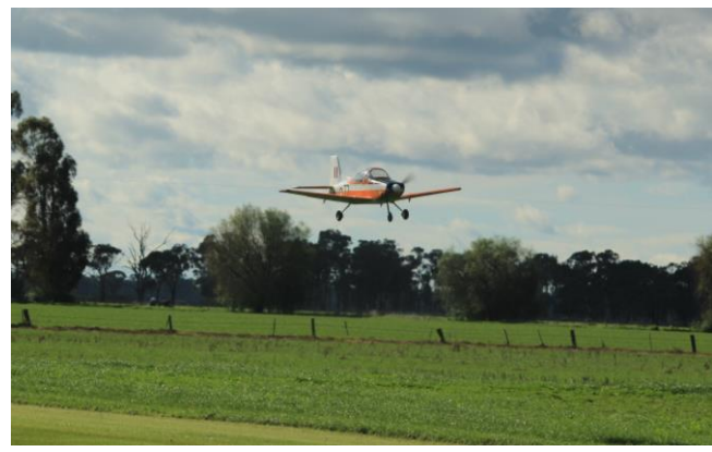
Noel Whitehead's CT4 on a landing approach.