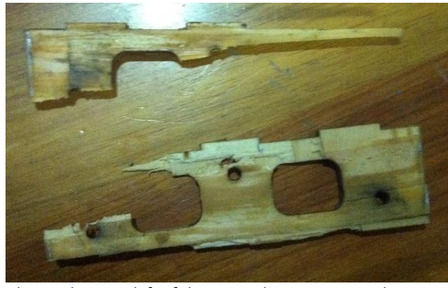
This is what was left of the original UC mounting plate.

The damage wasn't bad; reglue the elevators, make a new mounting plate, tape a couple of small holes in the covering. This is the second time the undercarriage has pulled out of this plane. The first was quite a long time ago and the landing plate pulled out cleanly on a pretty good landing due to insufficient glue. I will never understand why anyone would lighten an undercarriage mounting plate or skimp on glue here.