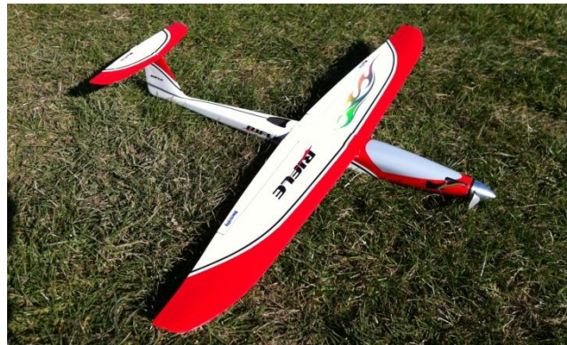
Great Planes Rifle – at 31" span it is small, but it's fast!

After the recent incidents with batteries coming loose at the field I went beyond the recommended strip of Velcro. I used a piece of fibreglass reinforced tape to form a sling around the front of the battery which is stuck to the sides of the fuse just under the wing. A piece of Velcro keeps it from sliding backwards.