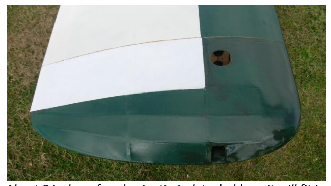
About 8 inches of each wingtip is detachable so it will fit in Len's small car.

This is definitely aero modelling from a different era and like Dave's Widgeon makes a very refreshing change from all the modern stuff we fly these days.