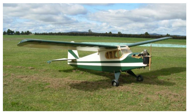
Len brought his 41 year old LA Special out for an airing. Model is in excellent condition for its age. 3m wingspan and powered by an Enya 60 four stroke.

thought my P39 was the oldest flying model in the club but Len has gone and upstaged me! The model featured below was built by Len back in 1967 when he was a mere 26. (Now there's a coincidence, I built my P39 in '76 when I was 26.)