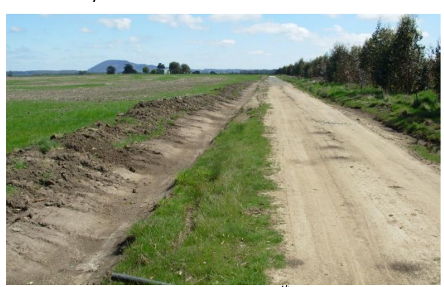
This photo was taken on Sunday 25<sup>th</sup> September. Only a couple of weeks ago the track was under water. The drainage channel, the crushed rock and the recent dry weather has saved our scalps!!!

Max had some prices for coarse road base and delivery which from memory was around $800 for the amount deemed necessary. This seems a lot to spend as we may not be there much longer but the alternative of doing nothing may well have meant no access to the field for several months. It was put to a vote and carried unanimously.