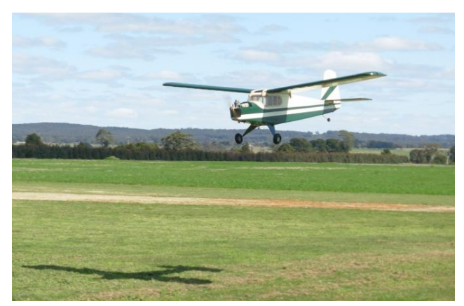
One of many low passes over the strip. It would make a good lolly dropper on our display days!!!

The day was perfect for Len to put the old beast through its paces. With many low passes, tight turns and loops etc all very close to mother earth it made quite a spectacle.