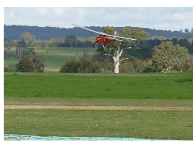
I noticed Dave bringing the Widgeon in for a dead stick landing and managed to get this shot as it came in over the edge of the runway.

Everyone finds it very refreshing to see a model that has been scratch built and not out of a box.