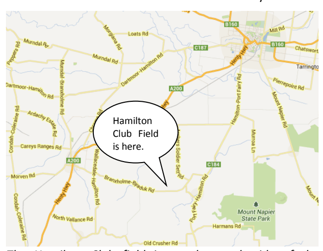
The Hamilton Club field is on the north side of the Branxholme – Byaduk Road where identified above, 21km from Hamilton city centre.

I've included a map showing the field location having noticed that the location pointer on the VMAA web site Google Map is out by about 20km to the south west. However the written address is correct in the fly out.