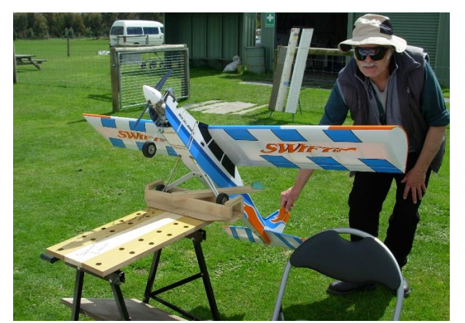
With the arm swung out of the way the nose of the model can be raised while the main wheels are securely restrained in the cradle.

fuselage when in the position shown. If the nose of the model needs to be tilted up to test engine fuel draw the arm is simply swung out of the way.