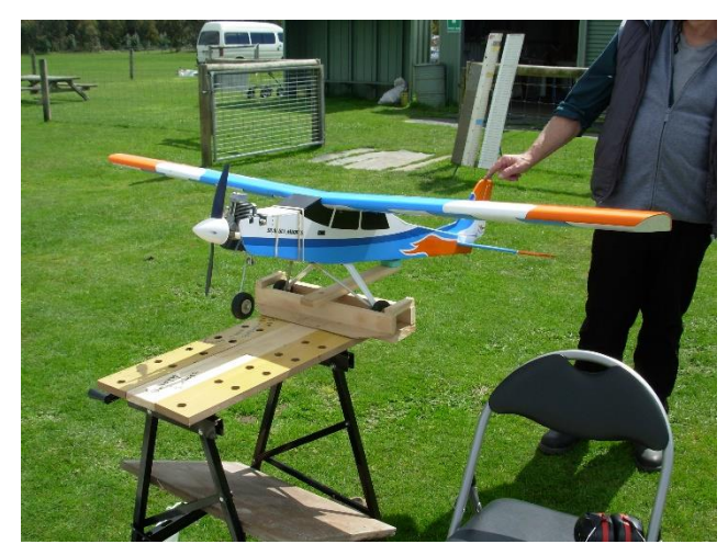
The rear pivoting arm supports the rear fuselage and can be swung out of the way.

I saw Len walk into the pits carrying a strange looking contraption that he had obviously made. He then proceeded to clamp it between the jaws of his work bench. All made to hold the model off the ground at a comfortable height for starting and doing flight line checks.