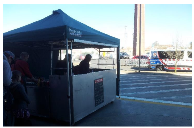
The picture taken at 9:30AM is a bit dark with the shade from the building. Looks like Glenn on the BBQ and Graeme alongside serving. An ambulance pulled up into the car park first thing, we thought it might be something to do with our cooking!!! (It obviously wasn't on a call.)

It was the day before Father's Day which no doubt contributed to good trade for Bunnings which in turn was good for us.