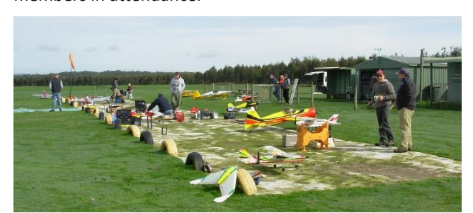
Very relaxing to get out to the field of a Sunday morning. Spread a bit of bulltish, tell a few lies!!!

Overall there's been some pretty good flying weather this month both for the mid-week crew and the Sunday fliers. Sunday 8<sup>th</sup> September was no exception with many members in attendance.