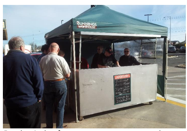
Even late in the afternoon customers were queued up.

Events such as this are great fund raisers and also a venue to promote our club and hobby. There are always people who are interested in what we do and it's a way of introducing ourselves.