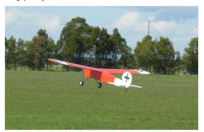
The Ugly Stik is a very old design dating back to the 1960's I would think. From memory they didn't have dihedral probably to simplify construction. I remember seeing them at Brady Road North Dandenong when a member of D&DARCS in the early days.