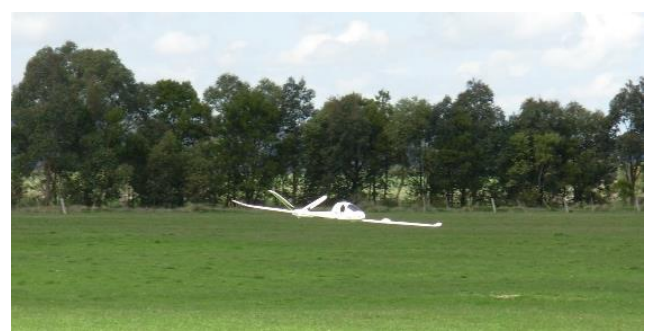
The Zephyr V-70 on landing approach or low pass.

The landing on the first flight was a perfect touchdown but with no proper skid to keep the wing tips off the ground it slewed around tipping over. On the second flight Richard managed to get the speed down a bit and it slid nicely on the grass — I think lubricated by a fresh juicy bit of sheep dung.