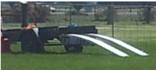
A file photo (4 th Oct 2014) that captured a shot of the trailer & ramps.

The Murray mower inherited a couple of years ago from the former Golden Plains club has also been sold. It was sold on Gumtree to the 1 st Ballan Scouts and went for $700, a price similar to other mowers of its type advertised. The club is keeping the trailer and the lightweight aluminium ramps that came with the mower. It fits comfortably in the old container now that the space has been freed up by removal of the shed materials.