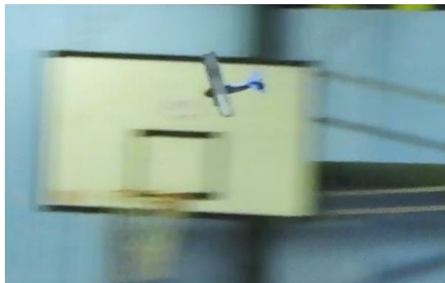
And almost a perfect slam dunk!!! Just looks close, would have missed by at least a foot.