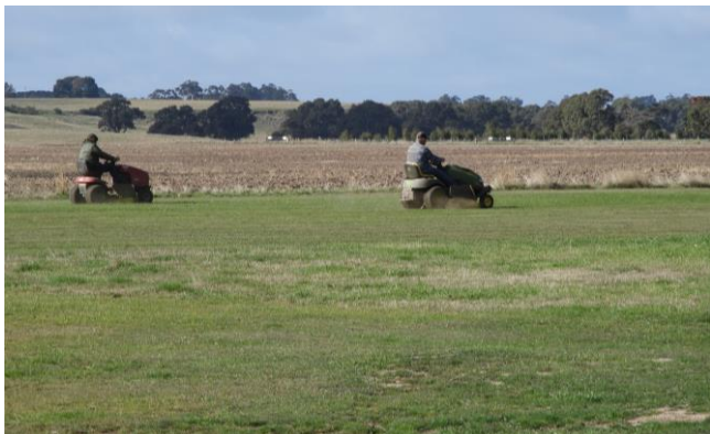
Looks like Murri Anstis & Peter Weston are having a drag on the mowers. The field is in pretty good shape at the moment. Hopefully the grass on the runways will continue to thicken with continued mowing. (Photo 7 th May)