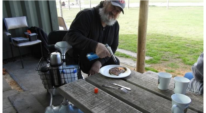
Lunch time – Looks like an episode from MasterChef on Sunday 21 st May!!! I just couldn't resist taking a photo.