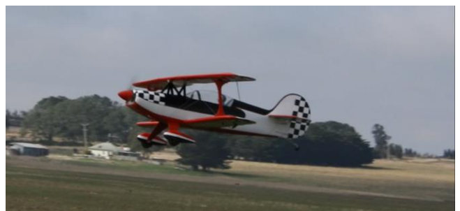
A frame taken from video filmed on Sunday 21 st May while doing a low pass over the field.

The technical details of the model are as follows: