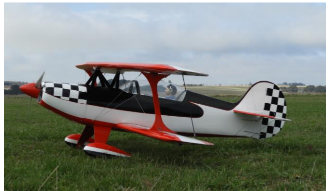
Another shot of Peter's Super Skybolt.