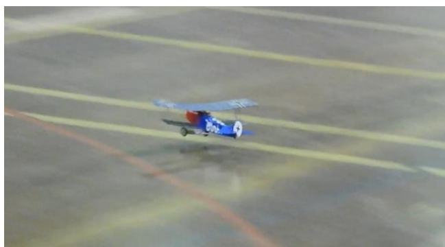
Graeme's little Fokker taking off.