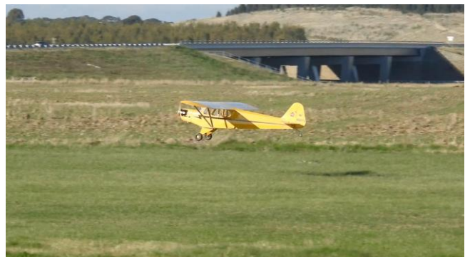
A frame taken from movie clip as Wayne's Piper Cub takes off. The Cub is powered by a DLE 35. (The Trawalla Bridge in the background appears close but it is a long way off. Video taken on Sunday May 21 st .)

It seems the gain is applied equally to each channel. To enable higher or lower gain on a specific channel, external software via PC/Smart phone hook-up is required.