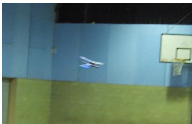
The little Fokker climbs out and all is looking good. The Fokker D7 flies extremely well.