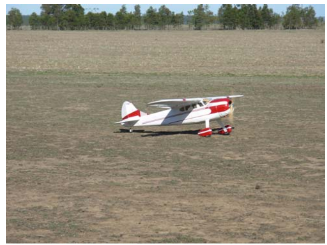
Glenn's Cessna 195 moments before its test flight.

Glenn did half a dozen circuits to get the feel of the model before doing a landing approach. Unfortunately there was a bit of cross wind so the landing had to be set up from the direction of the entrance gate. The first one was as expected too high and to fast. The next approach appeared to be on the correct path but the size of the model means it is further away than you think compared to the smaller models normally flown. On touching down it did a vicious bounce either due to the fact that the left wheel caught the rough section of the paddock at the end of the runway or Glenn was holding too much up elevator. As a result model came down on its nose and finished up upside down. Fortunately there was only very minor damage other than the prop ($50).