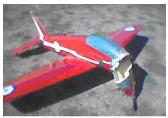
Nick provided this photo of the damage – the Hawk looks a bit sorry for itself. It has since been repaired.

diagonal to the runway. Then I realised I was coming in too fast with the idle too fast. It "touched" down and bounced up about 1.5m. What now? Let it down in the vacant pit area for an almost certain second bounce, or throttle up and go around? I opted to go around. A combination of the prop torque and the cross wind dropped the left wingtip into the ground, followed by a spectacular cartwheel. The result is shown below.