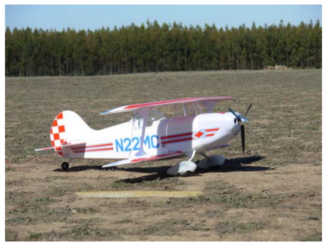
This could be a 100cc powered Pitts but its not. It's a small electric powered job belonging to Nick.

I received this little electric Pitts S2C, of about 30" wingspan, as a late Xmas present. It's a good looker and nice flier in calm and light wind conditions, but NOT a beginner's model. It has a 380 size brushed geared motor, 3 blade 8x6 prop and 8 cell 500mAh NiMH battery giving about 3 to 4 minutes flying. It is underpowered for aerobatics, but will loop, roll and stall turn. If I get keen then a 3S LiPo of about 1200mAh should be an easy fix to increase power and duration. It is a very compete kit including transmitter, receiver with built in ESC, and 3 off 9g servos, all of which were factory fitted, including the motor. The model went together easily and straight with very little trimming and adjustment required. It has a SADAC brand transmitter with no other brand identification. I carved the pilot from foam and coloured him with texta. (Does he qualify for scale points?)