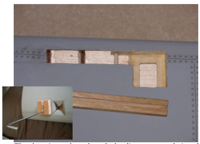
The photo inset, shows how the landing gear was designed to be fitted and was clearly unsatisfactory. The redesigned landing gear shown will use a more conventional landing gear block and long torsion bar.

I might also point out that the type of flying and conditions that the manufacturer envisages the model will encounter may be very different to your expectations. This was the case with my Warhawk for it was obvious from the very start that the mounts in the wing for the landing gear would not last one landing on our strip. Had the model been built strictly to the instructions the mountings would not have allowed any spring of the undercarriage resulting in failure of the legs or the wing structure that the mounts glued to. This model was intended to be flown by someone with a little more skill and finesse than me and flown from a well-prepared smooth strip such as bitumen or concrete.