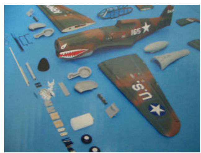
The CM Pro kits are certainly very well finished off and come with a lot of scale detail as you can see by this shot of the kit components.

Finally the day came after I was "released" from hospital where I was feeling up to starting on the model, however my strength and dexterity were not very good. Luckily for me Glen & Roger were both eager to see me get the model going and so, with their assistance and guidance the Warhawk took shape. Lucky because even though the landing gear mount looked a bit lightly built, I wouldn't have questioned the integrity of the mount owing to the manufacturer's reputation.