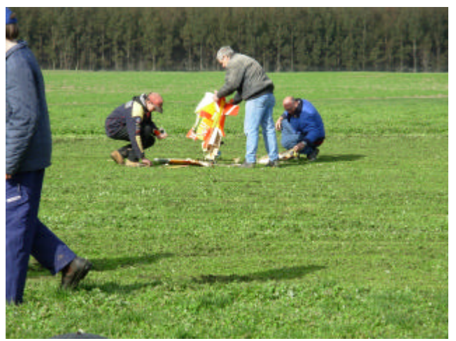
There wasn't much left of the Discovery Trainer after coming to grief in the middle of the runway, Russell did the right thing by sacrificing the model to ensure the safety of all participants that were out on the flight line.

to prevent other models falling in. Don't give up Russell at least you competed.