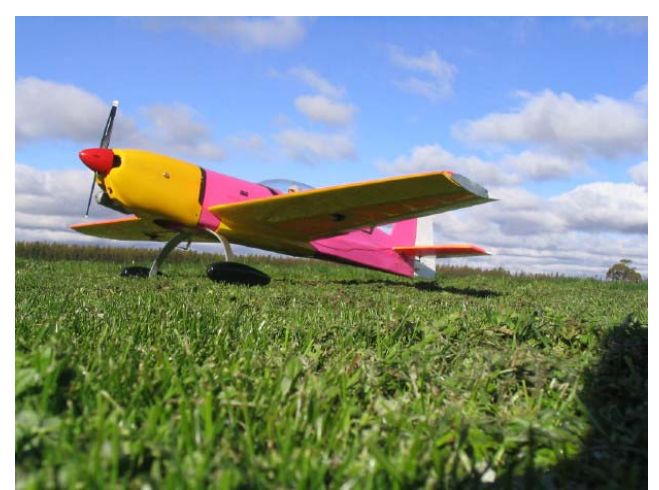
Russell's new Extra 300s just before its maiden flight. The color scheme certainly made it highly visible in the air.

Russell has been kind enough to provide some details on his new Extra shown below.