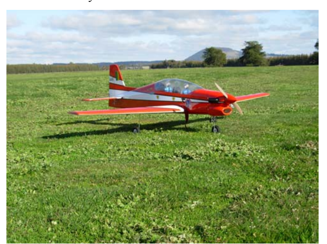
Another shot of Peter's new Tucano. Note Mt Buninyong in the background.

day. The Tucano is powered by an OS 46FX, which hauls it around the sky with ease.