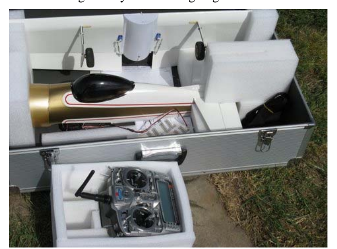
We didn't get a chance to get a photo of the Rare Bear out of it's box.

sprung into life – the Rare Bear lifted off and it was obvious straight away that it was going to be a handful.