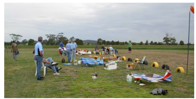
A photo showing many of the models entered.

Things got off to a shaky start as our main man slept in and was over an hour late. We took a little while to get organized but things fell into place as competitors began arriving.