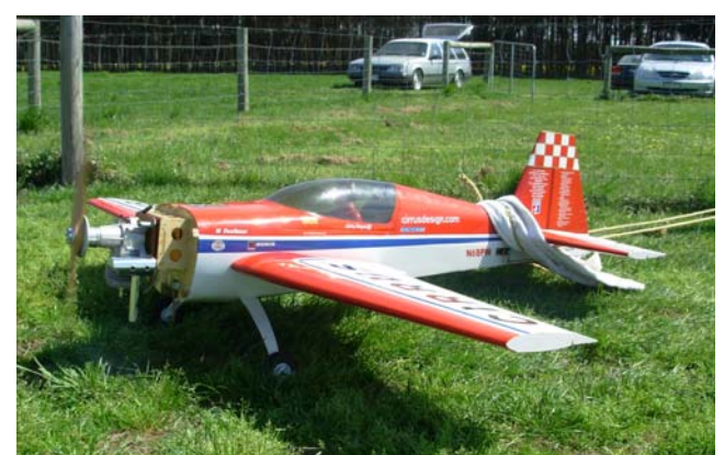
An earlier photo of the Extra as the engine was broken in.

Once the wings are repaired and a new wing tube purchased Glenn should have it out at the field again. Hopefully he will have better luck in future.