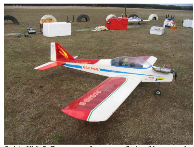
Rob's VMAR Escape out for its test flight. (Not a maiden flight because previously flown) You can see another Escape in the background which belongs to Peter Taylor.

Model was bought second hand at display day from Murray Ellis. Tail plane covering was damaged so this was recovered.