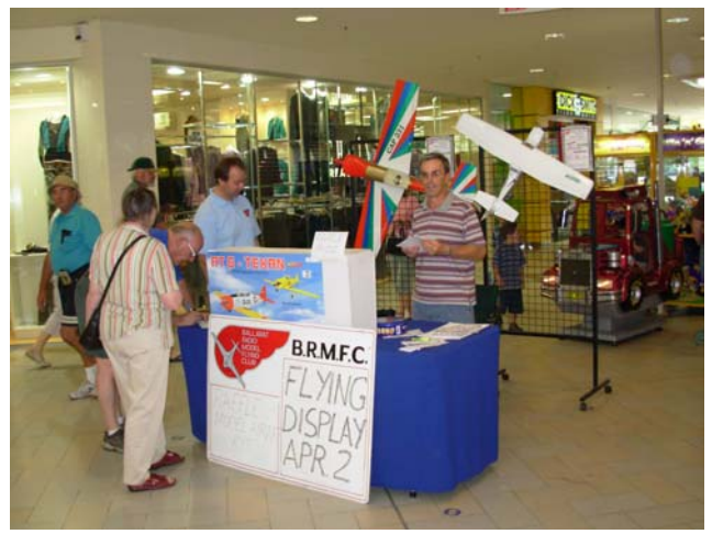
Another sucker, aah customer!

As a forerunner to our Annual Flying Display we held a static display at Stockland Wendouree on Saturday 25<sup>th</sup> March to promote the event and sell some tickets in the AT6 Texan raffle.