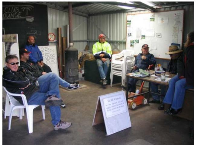
Saturday after we had finished preparing the field warming up around the pot belly stove.

Saturday was a not a good day weather wise as there was quite a strong cold southerly blowing all day. After the warm weather we had been experiencing it was a bit of a shock to the system, we had the potbelly fired up and made good use of it.