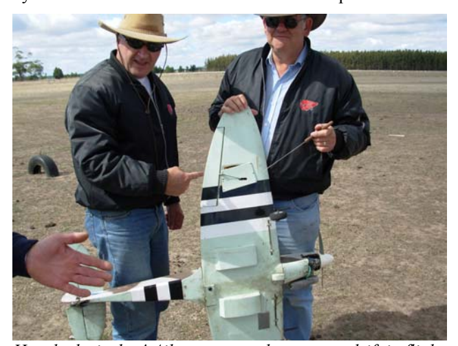
How lucky is that! Aileron servo plate came adrift in flight.

You can imagine some of the comments that were made by all the A's when it was realized what the problem was.