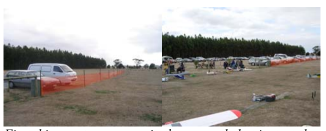
First thing, not many cars in the car park, but it started to fill by mid morning.

Sunday morning was a much better proposition. We got off to a slow start but the public began to file in by mid morning and there was a steady stream till mid afternoon.