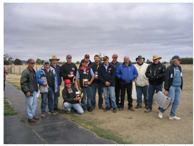
A Group photograph of most of the pilots taken after presentations.

All in all we had a good weekend, visiting pilots were impressed with our field and facilities and remarked that they enjoyed the day and look forward to returning next year.