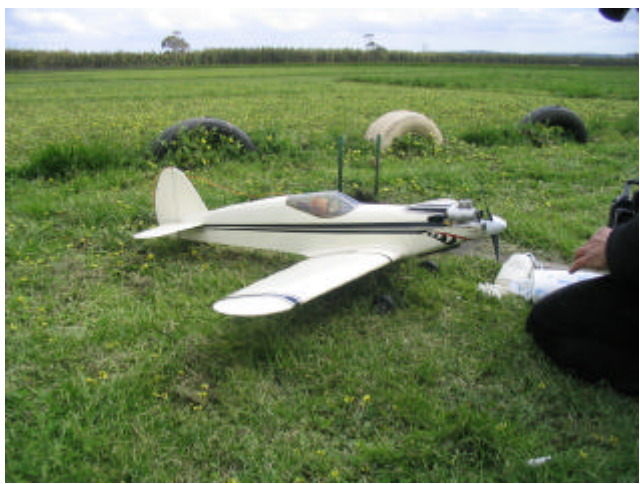
Another one of Len's many models – Powered by a K & B 40, this one is very fast and would have made a good pylon racer in its day.

out of the woodwork lately. Although the model is not new it is the first time it has been out to our new field. It isn't the type of model that you would expect Len to be flying (fast and furious) It is powered by a K&B 40 that I think came out of the Ark! Do you like the pilot?