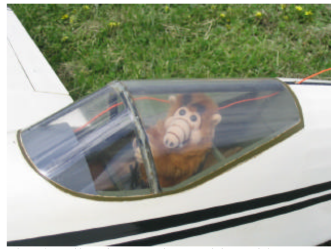
The pilot (Alf) underscores the age of the model.