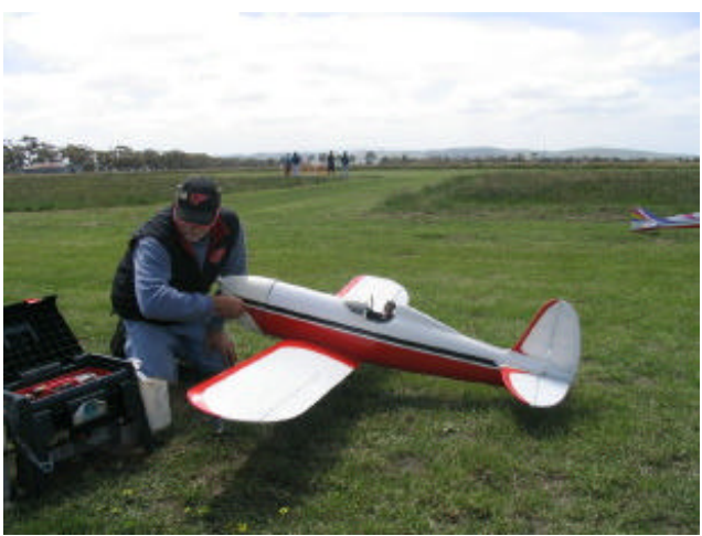
Wayne had a good day out with the OS 120 FS powered Ryan. It looked like glo plug problems at first but turned out to be a flat battery in the flight box – not enough glo.

Unfortunately there wasn't a big rollup but everyone enjoyed the day out and the hospitality of the Northern Flying Group.