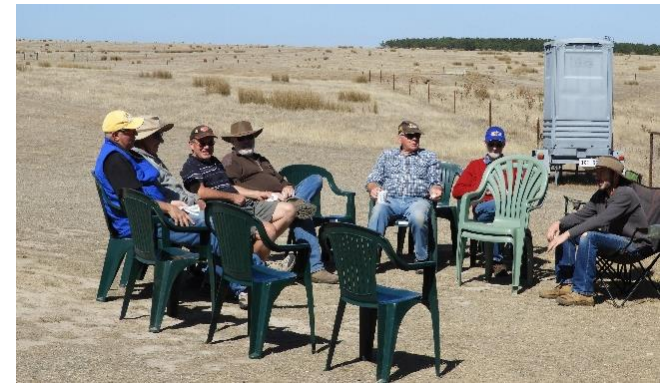
A chance to "shoot the breeze" at lunch time.