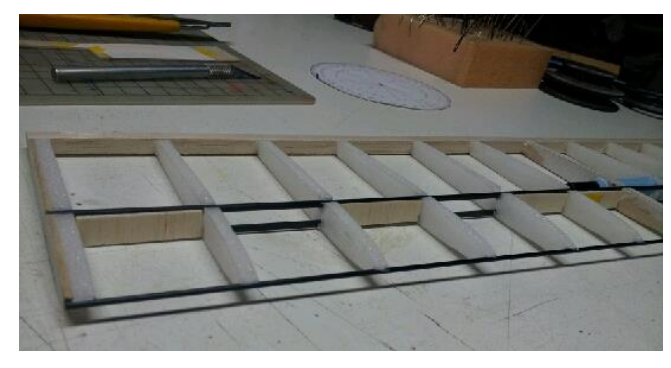
We suggested shear webs between the spars on every second rib which Alan has added.