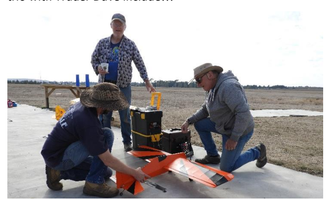
The old OS25 seemed to spring into life okay.