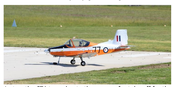
Just as the CT4 turned onto the runway for take-off for the 2^{nd} flight the nose and port main wheel hubs collapsed.

Noel Whitehead flew the CT4 quite well but unfortunately couldn't prevent a bounce on landing, something that I don't think anything further was thought about. On his next flight as the CT4 taxied out and was turning onto the concrete runway the nose wheel hub collapsed and on a closer look so had the port main wheel hub. A bit of background info is required here. Noel has had difficulty keeping the CT4 within the 15kg weight limit required for international competition and used very light weight plastic hubs as part of the array of measures to achieve the weight goal. It was simply just a matter of hubs not strong enough for a 15 kg model particularly when combined with the extra forces that a solid runway imparts on the undercarriage. That was the end of Noel's campaign.