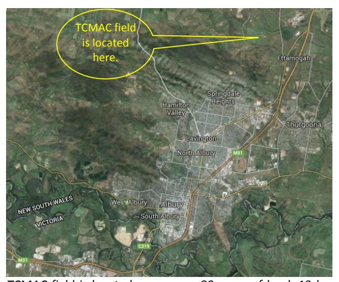
TCMAC field is located on approx. 80 acres of land, 13 km by road NNE of the Albury CBD.

It's a credit to the TCMAC members who have done an incredible job to purchase land (approx. 80acres) so close in to town and set up field facilities that must be amongst the best in Australia. They have also had immeasurable help from the Albury City Council in the form of road construction (bitumen track into the field) and monetary grants for field development. Of course you do have to present a sound business case to get council grants which includes things like bringing tourist dollars to town.