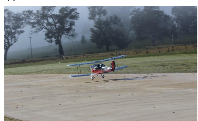
Noel Findlay's Fox Moth on take-off early on Saturday morning. There was still a bit of fog hanging around.