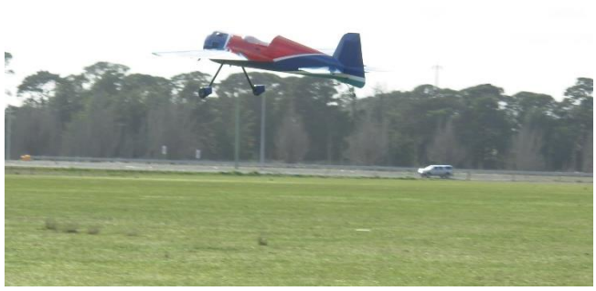
The Yak-55sp taking off on its maiden flight to be put through its paces.