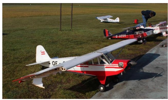
Damage to the starboard wing tip & upper wing mounting, bent wing tubes and presumably engine mount structure was the result of the impact with one of the shade tents. I'm sure Max will have it back in the air in the not too distant future.

Max was one of the first to get his model assembled and took the Super Cub down to the flight line for a practice flight. I heard the engine start while getting my WACO ready then looked up as I heard it rev up for take-off heading east along the runway. There were two shade tents erected along the north side of the runways for the judges and as I looked up I could see the Super Cub veering off the runway heading toward the shade tent visually inline between the strip and the pit area. I thought "Max you are going to hit that" while thinking he would cut the throttle and abort. But that was not the case and the starboard outer wing section hit one of the steel poles about 5 or 6 feet up swinging the Cub around and into the ground. My heart sank and I really felt disappointment for Max. He just got caught out on the concrete runway. It swung on him and he thought power would pull it through but unfortunately there wasn't enough room.