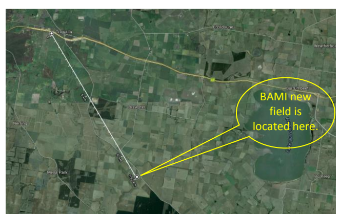
The new home of Ballarat Aero Modellers is 12km south east of our Trawalla field.

Flying fields are hard to come by close in to the city these days with the urban sprawl. The other thing, 30 years ago the average R/C model was much smaller and didn't require such large areas to fly. If you go out and have another look where we used to fly at Bowes Road Ross Creek which we thought was quite a big field at the time, it looks very small by today's standards.