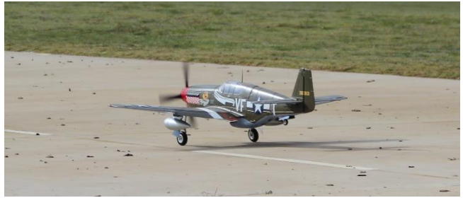
Roly Gaumann's P51 Mustang on take-off. Electric powered with retracts and all. Tracked quite well on the concrete. Came 2^{nd} in Flying Only.