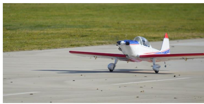
Super Chipmunk flew nicely and tracked extremely well on the concrete runway. Came a close 3<sup>rd</sup> in Flying Only.

stroke engine assisted by Joe Finocchiaro. Unfortunately Greg is still having difficulty keeping it running – we believe there is an installation problem.