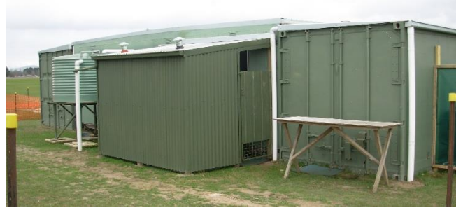
The BBQ enclosure (aka the chook shed) erected on Saturday 11^{th} July was finished off the following Saturday ( 18^{th} ) including a paint job to make it blend in.