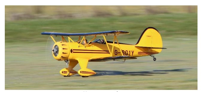
WACO YMF-5 on take-off. Came 1st in Flying Only.

Sunday morning arrived once again to perfect conditions. From memory two rounds of F4C were flown then we finished off round 4 of flying only , then completed one more round of flying only using one flight line. (If using two flight lines there must be an even number of rounds so all entrants have the same number of flights with each set of judges.)