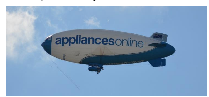
This Blimp came over the Albury field around 3:30PM on Saturday. I saw it in Ballarat on Tuesday & Wednesday. In fact it was almost over my house Wednesday around 6:30PM.

As far as I can recollect there were no other incidents to report. The flying was wound up by soon after midday which was immediately followed by the presentations. This enabled us to hit the road by a little after 1PM and get home just on dusk.