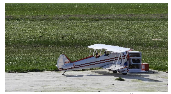
The old Super Stearman lost the OS200FS muffler nozzle.

On Sunday 4th August I (Ed.) had taken off on the third flight for the day with my Super Stearman. After a few circuits it was heading out over the south west corner of the field banking around when small parts could be seen coming off the plane. Immediately I thought it must have been the spinner cone because the prop loosened when the OS200 was started and maybe it wasn't tightened sufficiently. I flew over the strip and could see the spinner was still attached but then noticed the back of the muffler was missing so landed straight away.