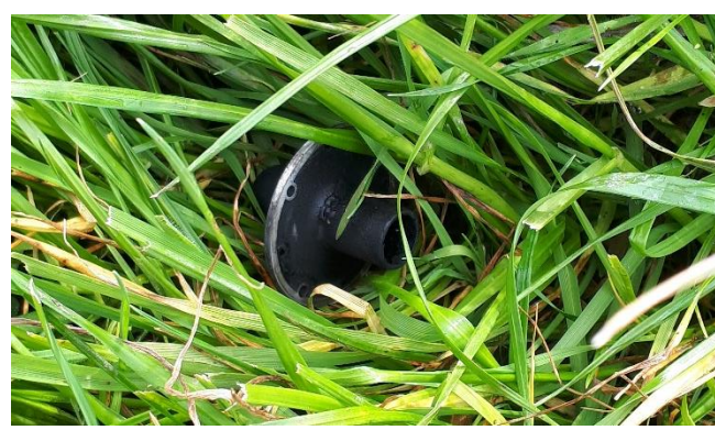
The baffle lying elusively in the long grass some 220m metres away.

wasn't long before the detector beeped. Once again I couldn't see anything in the grass and had to look really closely at where the beeping came from and there it was the elusive baffle.