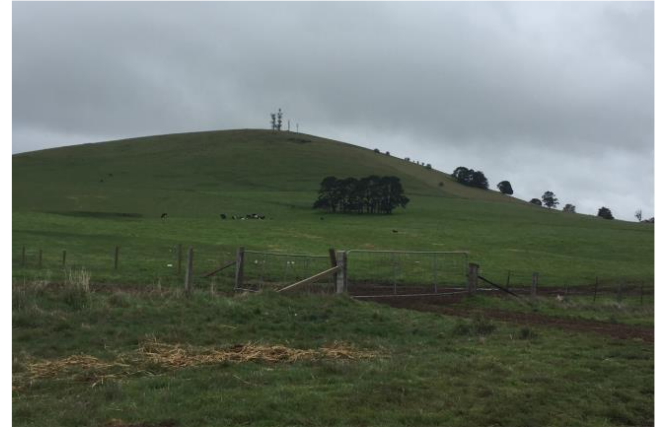
Mount Hollowback from the North West.

Mt Hollowback is an excellent, popular and well-known site for RC slope soarers and hang gliders. However, it's most distinguishing feature is a pair of communication towers providing TV, radio and mobile phone services for Ballarat. Until recently, this hasn't been an issue, but it is now clear that the recent installation of more and more mobile phone and Wi-Fi transmitters means that using 2.4GHz is no longer feasible.