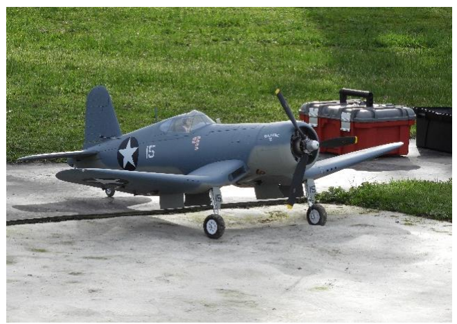
Another shot of Mark's F4U-1A Corsair.

It has a 1600mm Wingspan and comes complete with 60 size 5055-390KV electric outrunner motor, 80 amp ESC, 18 inch three blade prop and uses 11 servos.