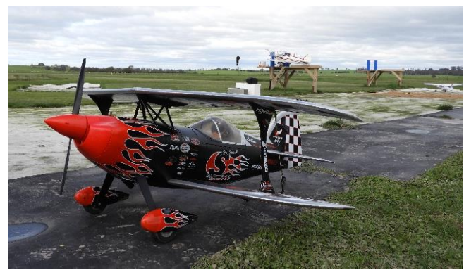
Looks fast just sitting on the ground. The full size is a custom version of a Pitts S-2S.

Video of the show routine <a href="https://www.youtube.com/watch?v=C3DQ9rcLBXE">https://www.youtube.com/watch?v=C3DQ9rcLBXE</a> if you want to have a look.