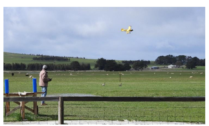
The ducks thought it was okay though and weren't too concerned about Alan's model overhead.