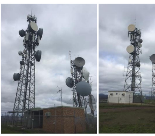
Several towers within the Mount Hollowback Complex.