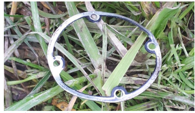
One of the gaskets found on a sheep track. (44mm diam.)

I then leisurely dissembled the Super Stearman and loaded it back in the car. Then I thought before leaving, why not have another quick search. I went out to where I was flying from and lined up on one of the trees in the south/west corner which I reckoned lined up with where the muffler came off. Then headed off in that direction and started searching when about 150-200m away. After about 10 minutes I found the muffler gasket sitting flat on one of the sheep tracks. It was the sheep track that saved the day.