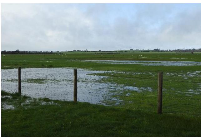
The East/west runway goes under water but it seems to drain away in a few days once the rain stops. Photo taken on Sunday 11<sup>th</sup> August.