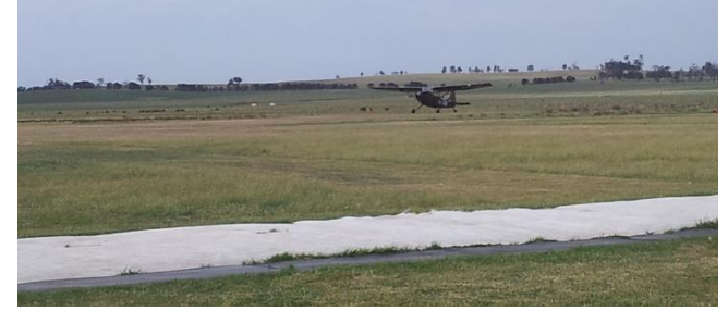
On Sunday 25<sup>th</sup> October the pilot/owner of this Cessna Birddog VH-LQX took off on our North/South runway into quite a strong northerly wind which made taxiing a bit of a concern for the pilot. The aircraft makes frequent visits to Trawalla as the owner has a property further up Church Road.