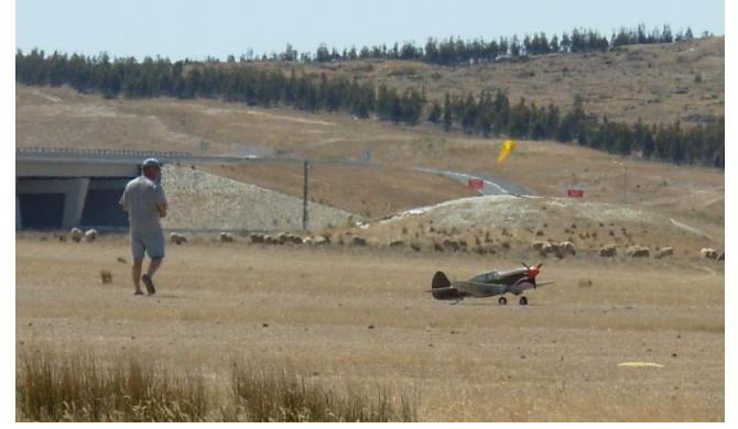
Peter Weston has a new 2m span P40 foam electric model. At 2m and foam, it is quite large for that type of model. From what I saw it seemed to fly extremely well. (Sunday 10<sup>th</sup> January)