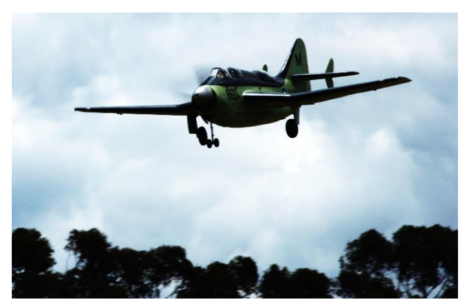
Fairey Gannet flown by Dave Chigwiggen on landing approach. This model powered by a Zenoah 62 petrol

It was good to catch up with some of the regulars there again and there were plenty of bargains for sale in the shed.