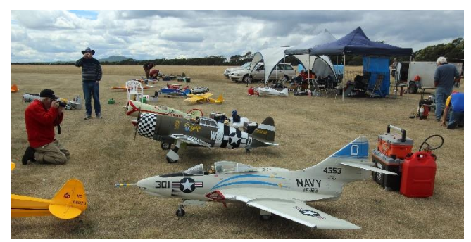
The turbine didn't fly – too dry & hot I presume.

The weather was good, a little on the hot side and humid, perfect for flies. They nearly drove us mad and at times made it impossible to fly.