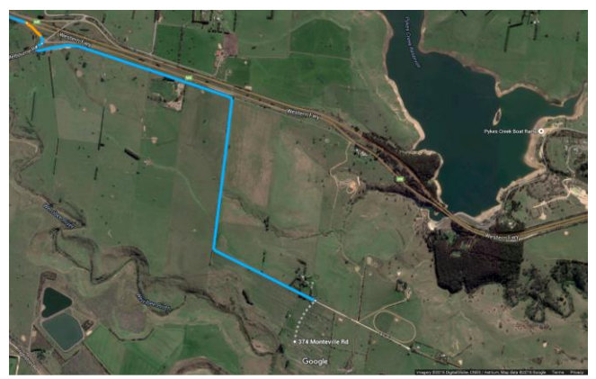
Location of Bacchus Marsh club's new field. About 1.5km as the crow flies, S/W of the bridge over Pykes Creek Reservoir and 40km from Ballarat.

The Bacchus Marsh club is developing a State Field at 374 Monteville Lane out from Ballan, 40km from Bakery Hill, Ballarat.