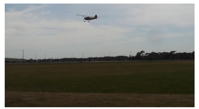
Climbing out heading north over the freeway. He did a 270° left hand circuit gaining height and headed off to Essendon Airport where it is hangered.