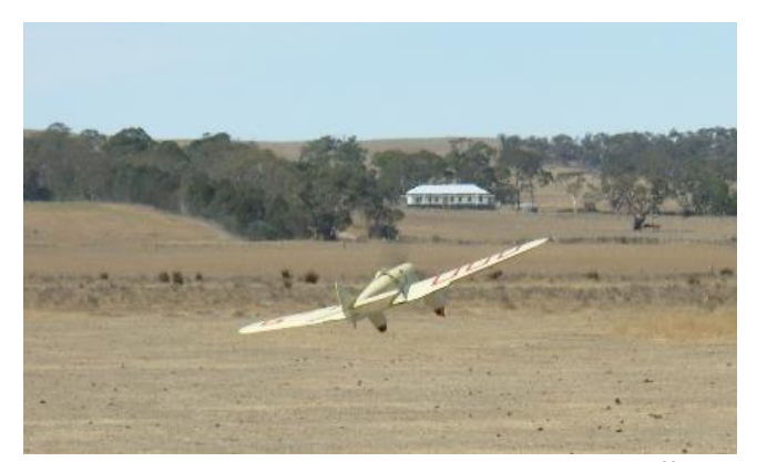
Glenn gunned the DLE35 and the Hawk headed off in a southerly direction down the runway, lifted off but veering to the left. Glenn said before take-off that it always needed a lot of aileron trim but he couldn't remember which way. (Well it is 15 years since it has flown) After applying heaps of right aileron and up elevator he finally managed to get it trimmed and under control. After a few basic manoeuvres to pass the heavy model inspection and several circuits it was time to land. The first couple of approaches were too high and fast and then the engine started to sound a little unreliable from most likely overheating in the cowl. So landing became an imminent necessity on the next circuit when the engine finally quit on approach – fortunately Glenn got it down okay. No doubt there will be more to come so stay tuned.