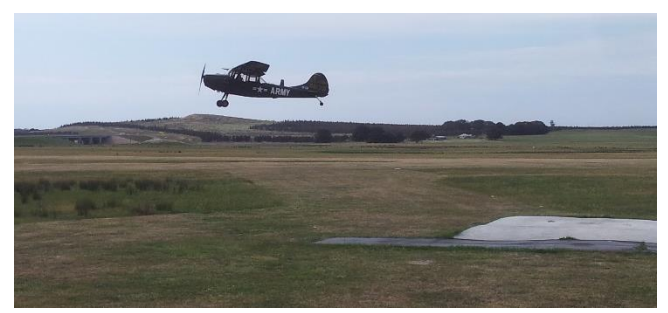
The Birddog was off in much less than half of our north/south runway. It has a similar sized engine as a Cessna 182 (Continental O-470-11 flat six) so it has reasonable performance.