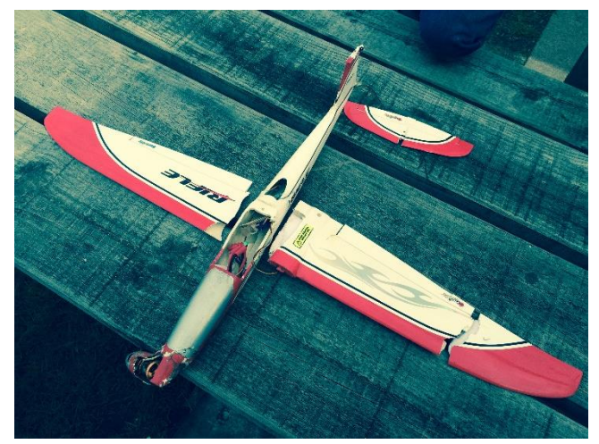
Almost looks repairable but the fuse is cracked and "floppy" in more than a few places and the tailplane has had the bottom torn out where it meets the vertical stab. Mmm... maybe ...

I hadn't flown it for a while due to the weather but last Sunday Sept 6, was reasonable, with gusty 30km/h winds. The first flight went uneventfully as I slowly got my mojo back with just a few full elevator pylon turns. The second flight was following the same pattern but getting more aggressive when the wings folded about 10m off the ground in a full elevator, full throttle pylon turn. It hit the ground hard, crunching the fuse and breaking the tip off the other wing. On inspection I was a little surprised to find out that it was one of the earlier models without the strip of carbon in the wings. If I'd realised that I may have put in a spar, but I'm certainly not complaining - it has served me well.