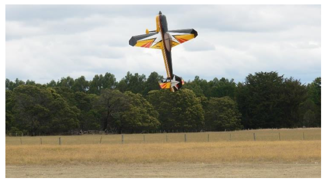
Mat Werner doing 3D flying with his YAK.

It was good to catch up with some of the regulars there again and there were plenty of bargains for sale in the shed.