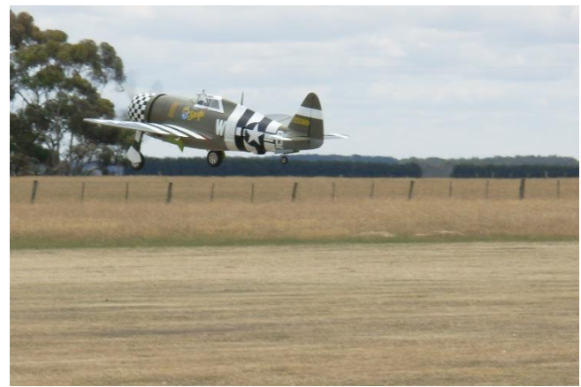
Garry Bergen's CARF models P47 Thunderbolt on take-off. Garry is a member of the CONSTELLATION MODEL FLYING CLUB in South Australia and obviously a very serious modeller.