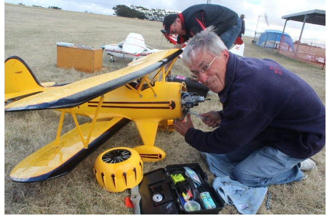
I put this photo in under sufferance. The muffler came loose requiring some on field maintenance to the Waco YMF-5.

There was a good range of aircraft with models in the air continually throughout the two days. There were one or two mishaps the biggest being the loss of Wayne's new Stuka. The Stuka was flying well and had been in the air for some time when on one pass the motor missed a couple of times and then stopped at the same time as Wayne lost all control of the model (on later examination of what was left Wayne thinks it was either the main switch or the battery pack). The model crashed quite a distance away and is unrepairable.