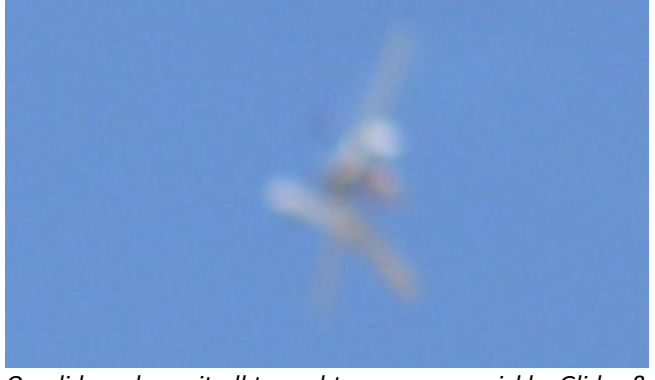
On glider release it all turned to crap very quickly. Glider & tug got tangled up. Sorry it's all out of focus – happened too fast for my camera, but you'll get the general idea.