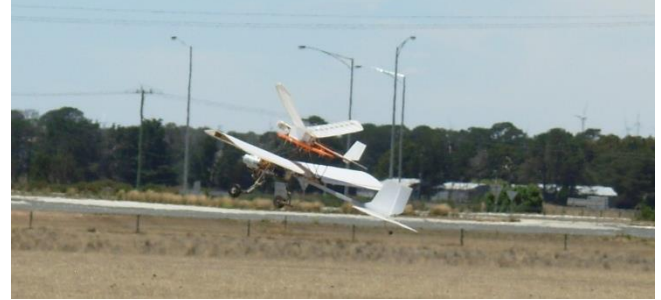
Take-off, all is looking good so far. Wings on the glider are flexing enormously though.