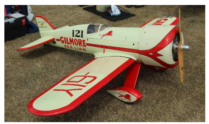
Gilmore racer belonging to Barry Angus from Mildura.

There was a good range of aircraft with models in the air continually throughout the two days. There were one or two mishaps the biggest being the loss of Wayne's new Stuka. The Stuka was flying well and had been in the air for some time when on one pass the motor missed a couple of times and then stopped at the same time as Wayne lost all control of the model (on later examination of what was left Wayne thinks it was either the main switch or the battery pack). The model crashed quite a distance away and is unrepairable.