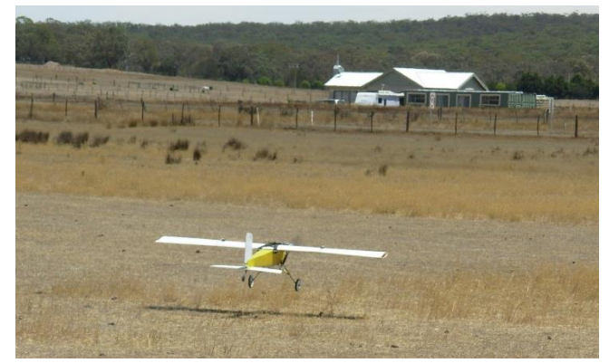
Greg at the controls on take-off.