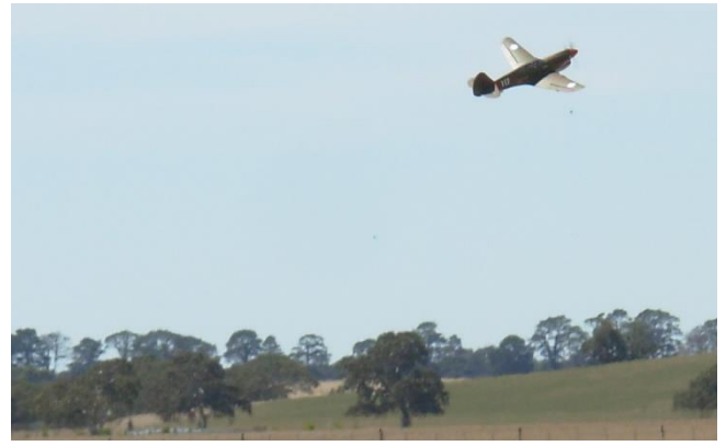
The P40 on climb out after take-off. Looks like it has plenty of power.