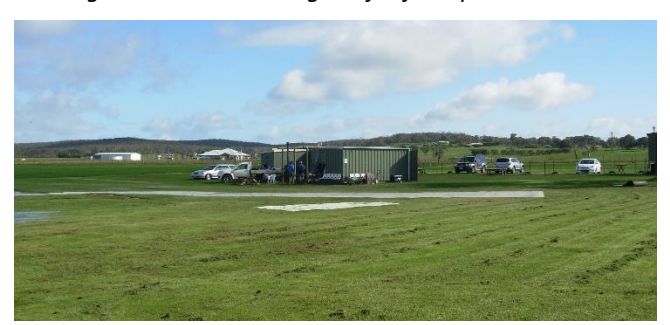
The pits are now on higher ground which is a fortunate side effect of the shift. We may shift the large model start up area to the south end where it would be more central to both runways.