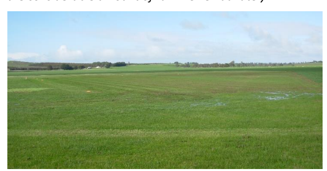
The East/West runway (looking east) is significantly shorter than the N/S and subject to a bit of water collecting at the western end but still quite usable. Probably only get used when there is a strong westerly blowing. That being the case you don't need a very long strip.