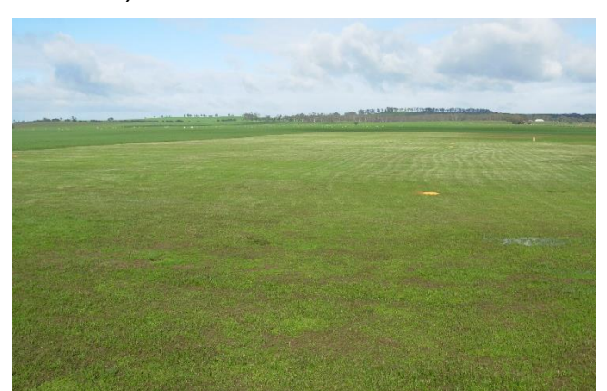
The North/South runway (looking south) is in pretty good shape and fortunately doesn't get water logged even with the considerable amount of rain we've had lately.