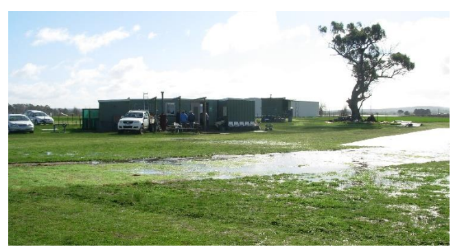
The wet area is where the pits were before we moved the matting. Would have been good for float planes.