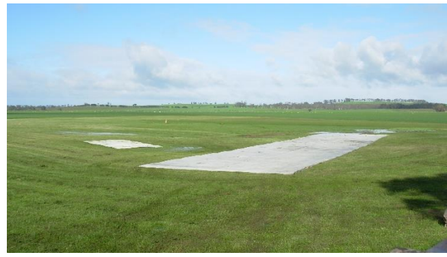
The realigned pit area which is now parallel to the main N/S runway and about 20m north to provide clearance with the reinstated E/W runway.

To keep the troops fed, Graham Waterhouse brought out some homemade chicken & noodle soup (very much appreciated June) as well to supplement the ubiquitous BBQ sausages. Ted did the honours on the BBQ, a bit of practice for the Bunnings gig on Saturday October 15<sup>th</sup>.