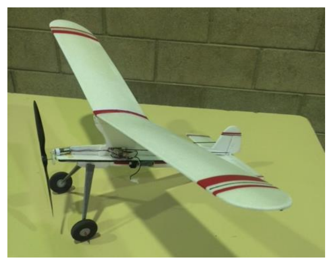
Kevin Howard's 1/4 Pint weighs 28q.