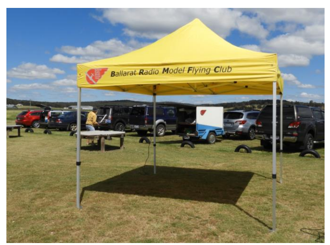
The new club marquee purchased a couple of weeks ago from <u>Outdoor Instant Shelters</u> located in Cheltenham.