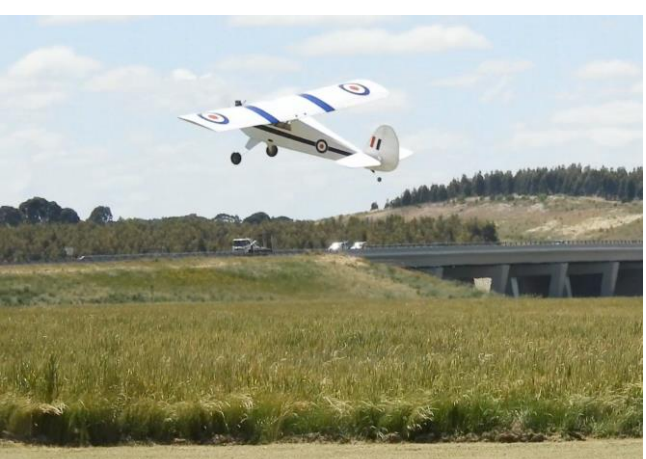
There was a northerly breeze blowing but pretty much straight down the strip. The LA handled it without difficulty.