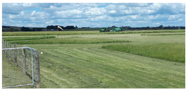
According to my photo album the last crop was harvested between 15<sup>th</sup> & 29<sup>th</sup> January this year.

t the last committee meeting held on 1<sup>st</sup> November it was decided to place an ad in the Courier newspaper Community Diary page to promote the club. An ad was submitted on 14<sup>th</sup> November to start on Thursday 16<sup>th</sup> November and run for 5 weeks at a total cost of $10. The ad submitted had the following wording: