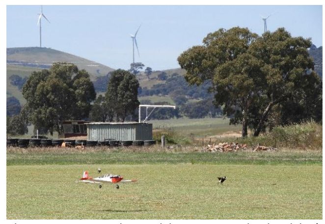
The Magpies are used to models coming in to land and don't take much notice. The wind towers weren't there two years ago when I was at the field last.