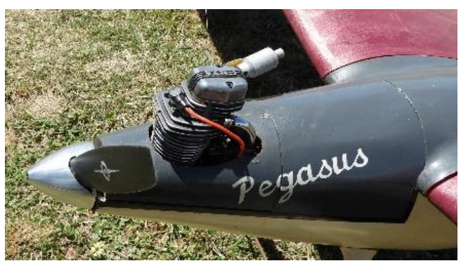
This one is powered by an Enya 60 four stroke.