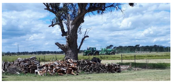
Just as the last of us were packing up to leave around 3:15PM on Sunday 19<sup>th</sup> November a Trawalla Estate tractor towing a spray boom came in and started going around the crop from the outside working its way in. I guess an insecticide or herbicide before it is harvested.