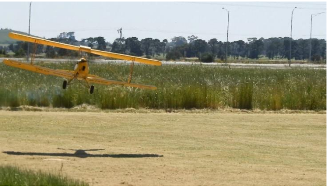
A few frames further on and moments from touch down. There was a crosswind component to contend with which accounts for the bank and sideslip.