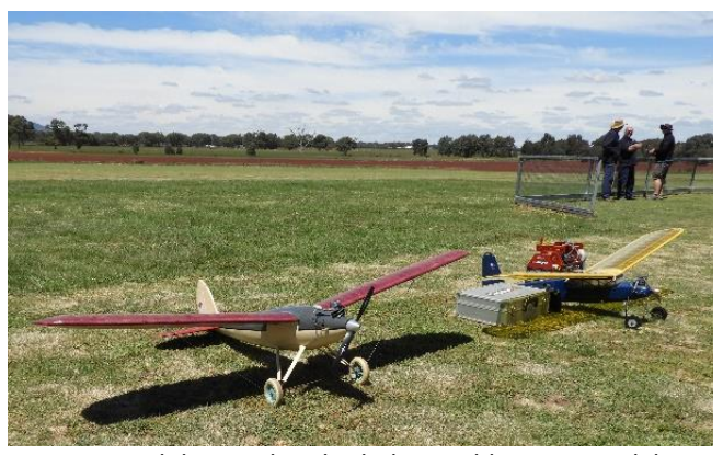
An Ararat club member had these old timer models on display. From memory he said they are about 15 years old.