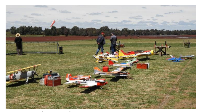
A line-up of some of the models at the event.