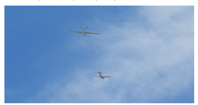
It must have been a fairly active day at the Ararat airport with glider towing. Quite often you could see them to the south of the field towards the airport but this pair came overhead.