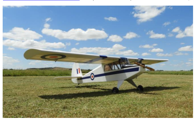
Noel Findlay's new LA Special out at the field on Sunday 19<sup>th</sup> November for its maiden flight.

oel Findlay came out to the field on Sunday 19<sup>th</sup> November to test fly his new scratch built LA Special (a design by the late Len Astbury). The LA is covered with tissue & dope then painted – the way model aircraft used to be built. And Noel being one of the countries great builders it looks extremely good, a refreshing change from iron on covering and foam. It's powered by an old OS 40 four stroke. (For interest, according to the OS Engines Manufacturing Timeline they were first produced in 1981.)