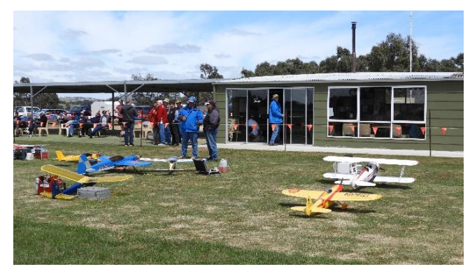
Ararat club house in the background with mostly BRMFC member models in the foreground of this shot.