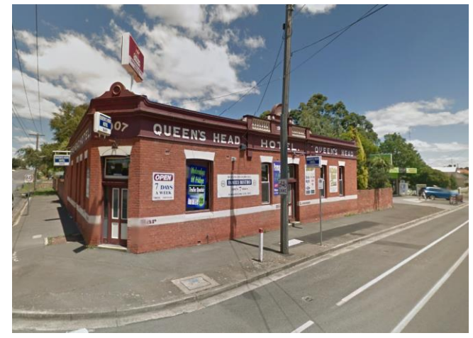
The Queens Head Hotel, corner of Humffray St North and Queens St North.

busy Christmas schedule. It would be great to have as many there as possible. Numbers 'maketh' the night!!!