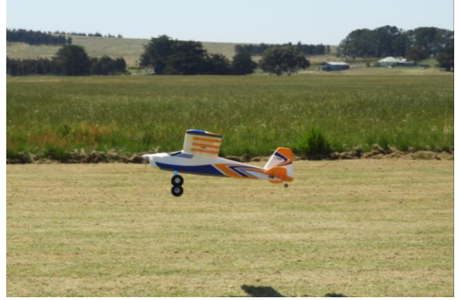
And away she goes!!!