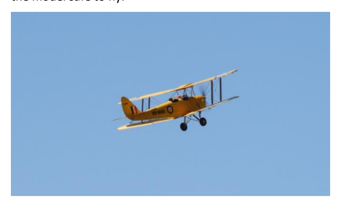
The climb out looked good however it needed a fair bit of aileron and rudder trim to counteract roll to the left.

matched by JB Auto Paints which they put in a spray can. The result was quite effective, worth the effort and made the model safe to fly.