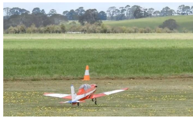
And we have lift off. I think this was about the third flight.