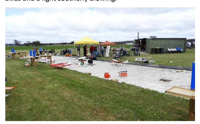
When I (Fred) arrived at 8.30 am Anthony was setting up his Blackhorse PC-9 and a visiting pilot was preparing his large Piper Cub.

The weather forecast was favourable and apart from some early mist the day turned out to be a pearler with sunny skies and a light southerly blowing.