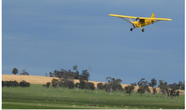
I managed to get this shot on a slow pass over the field or maybe it was a landing approach. Most of the time the Cub is doing aerobatic manoeuvres.