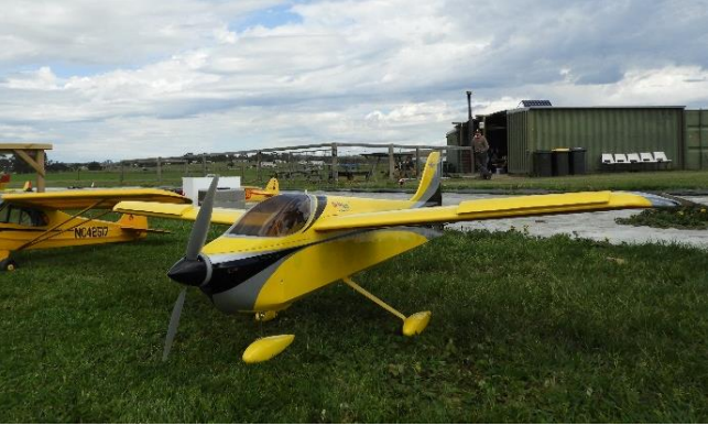
Note the anti-stall slats fitted to the outer wing leading edge.