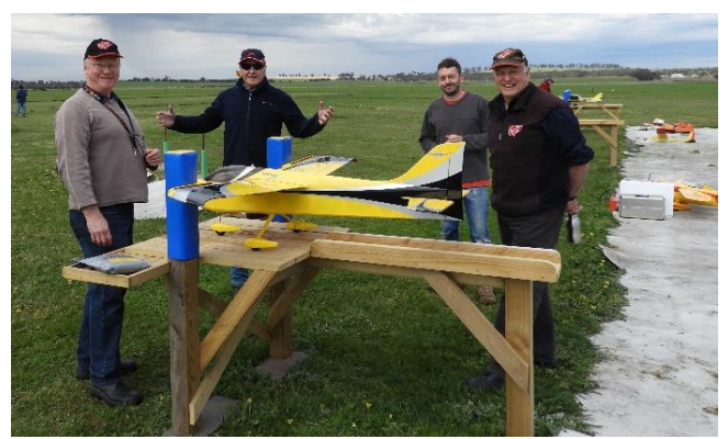
I wonder what they're all on – whatever it is I'll take a kilo. The model stands have proved very popular.