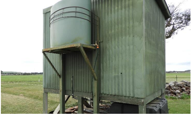
All the copper pipe from the tank to taps has been replaced with garden hose.