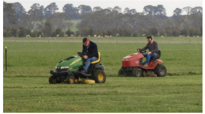
Looks like they're havin' a drag. I think the John Deere is slightly faster than the Toro down "conrod" straight. Photo Sunday 7<sup>th</sup> October.

The mowers have to work pretty hard for a couple of months of the year to keep the runways operational and also maintain the general appearance of the field and car park area.