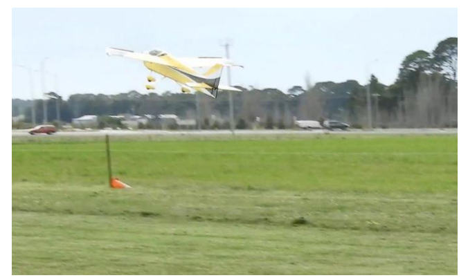
From memory there was a moderate northerly breeze but it didn't seem to bother the Stev S 30E given that it is a very light model. Certainly had plenty of power.