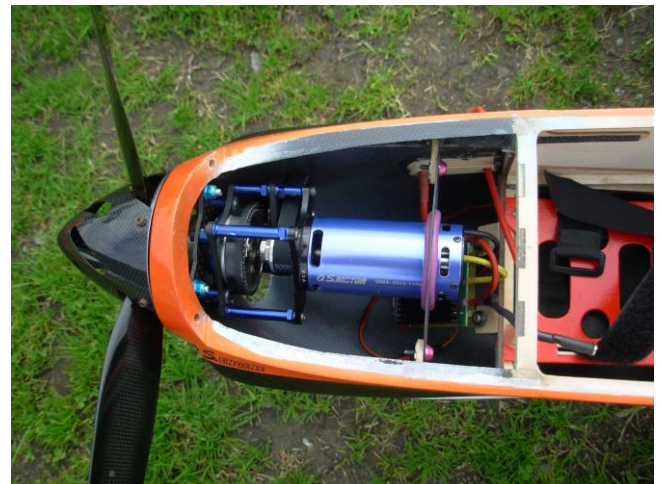
The belt driven 7:1 reduction assembly in Tom Bloodworth's pattern aerobatic model.

They certainly have great facilities and to keep the whole show going takes a lot of work. Norm is the field manager and after a guided tour around it is no wonder the position is basically a full time job. They have a newly constructed shed with 3 car hoists to park their tractors & mowers on so they can be raised above the known flood level. They are raised every time parked back in the shed after use. I was expecting to get my car serviced when I saw it all!!! But the reality is it is necessary because flooding is