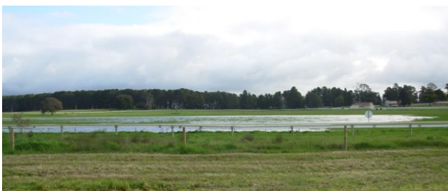
The Burrumbeet Racecourse field was also inundated with water. The actual location of the N/S runway is in the background and I would say just above the waterline. Photo was taken from the road on September 18 th .

While it's wet be careful where you drive so as not to tear up the ground particularly in the area between the pits and kitchen. The car park and gate entrance seems to be handling the wet but still requires everyone to take it easy to avoid skidding the wheels. Thinking back on it we had more of a problem at Yendon with the long entrance track that flooded after prolonged rain fall and stayed wet until the summer months arrived.