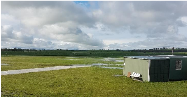
Murri Anstis took these shots on Wednesday September 14 th which convey the effect of the prolonged rain. This one was taken standing on the toilet stairs.

148mm of rain has been recorded at Ballarat Airport for the month of September (as of 26 th September). The average for September is only 71mm. We didn't get any heavy rain – just continual light/medium rain over a couple of weeks.