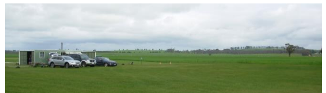
Once again hard to see the fence in the photo, but it now goes across to the road fence instead of behind where the cars are parked.

When the fence was first erected it ran across the back of the car park to the toilet as a quick means of keeping the cattle out of our field area. This meant it needed to be turned off and laid down to get in. On Sunday September 18 th Murri and I (Roger) rerouted it so that it runs up to the road fence on the south side and across to the big shed on the north side. Now it doesn't need to be turned off unless special needs arise.