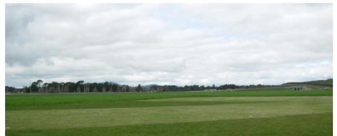
It is hard to see in the photo but there is now an electric fence around the field perimeter. Photo was taken on September 11 th , the day after it was erected.

Interestingly though, we haven't seen the cattle in the paddock since the fence was erected. It seemed strange that the cattle would be in with the crop. Maybe the wet weather has changed their farming practices.