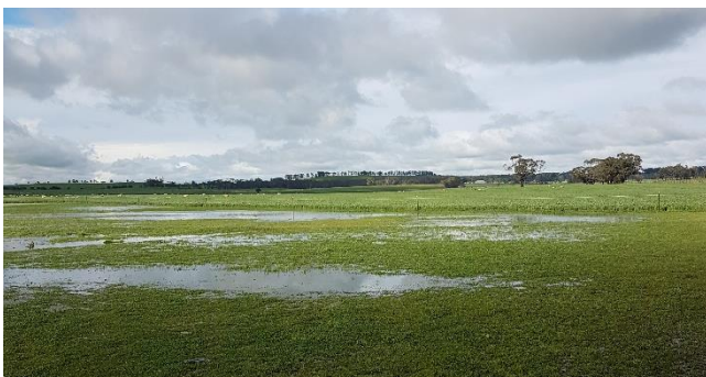
This one was taken from the southern side of the facilities looking over the e/w runway which is clearly under a layer of water as is the area between the facilities and the pits.

The front of the kitchen/containers being the low point has collected a bit of water and remained wet underfoot but fortunately seems to drain away once the rain stops.