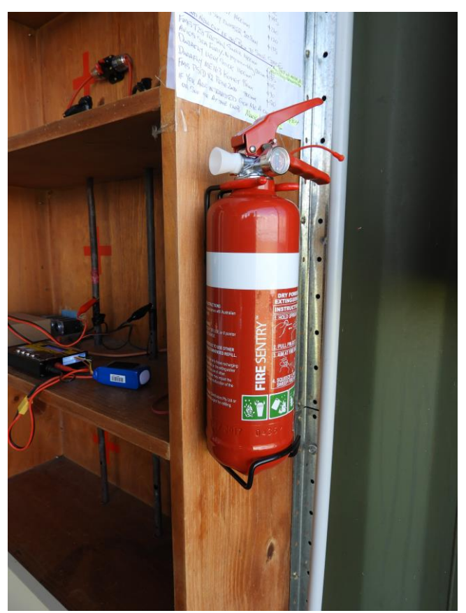
Two new fire extinguishers were purchased recently to mount outside. One is attached to the battery charging station. The other out on the fence next to the pit area. They aren't left out all the time just when needed.