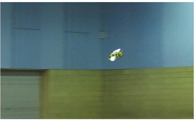
Now on the second lap