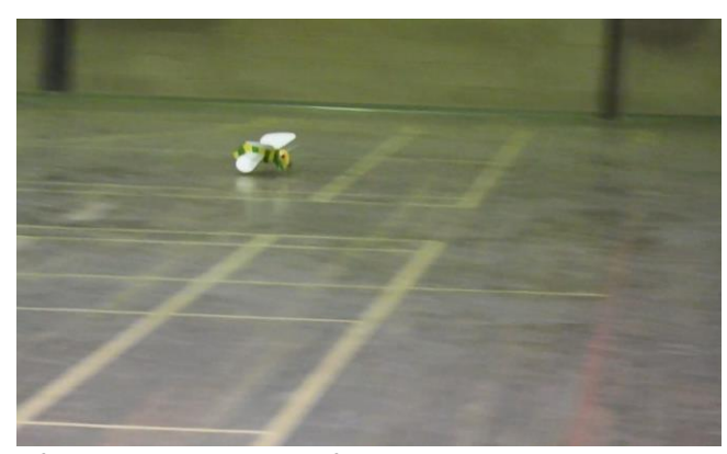
After almost two and a half laps the motor quit and it settled down for a landing. I'm not sure if it is on a timer or that is how long the battery lasts for.

The indoor flying has been extended for an extra month so the next two events are October 4^{th} & 18^{th} .