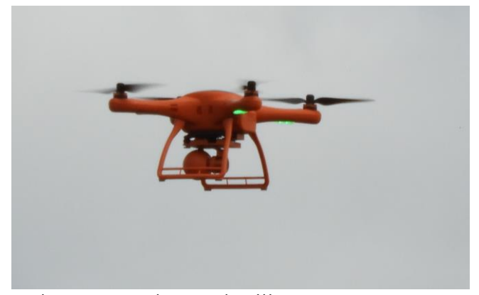
Looks a mean machine up close!!!