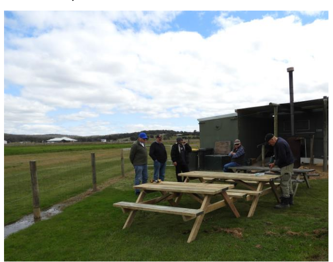
Over the past few weeks Murri had constructed the leg assemblies for the two new table/seats as well as cutting the tops and seat to length. There were a few helpers available on Sunday 10<sup>th</sup> September to assemble the parts to make up the new seats. A job well done.