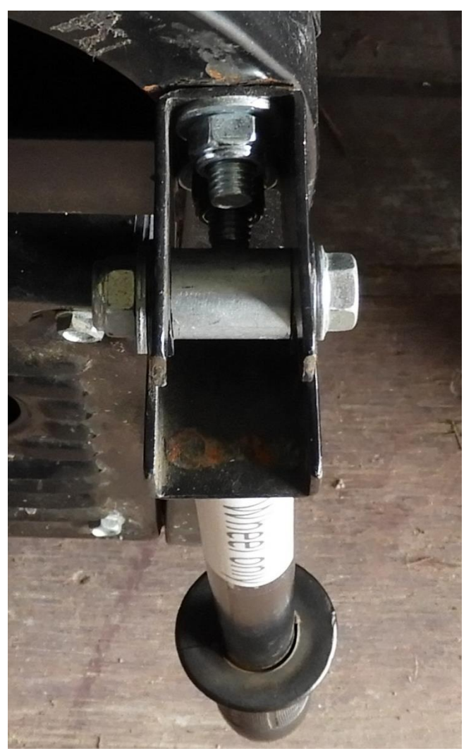
Fitted spacers to the generator handle brackets to prevent the "fingers" from collapsing inward. A job that has needed doing ever since it was purchased. For the money it's a great generator – just needed a bit of finishing off.