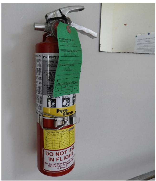
Peter Evans was able to acquire two 1kg dry powder fire extinguishers which are removed from new aircraft imported from the USA. These were mounted on the two internal walls of the kitchen on Sunday 27<sup>th</sup> August. This one is at the entrance.

In total four new 1kg dry powder fire extinguishers have been obtained to ensure we are fire ready as the hot weather approaches.