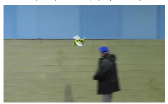
Just completed lap one as it went past Clive.