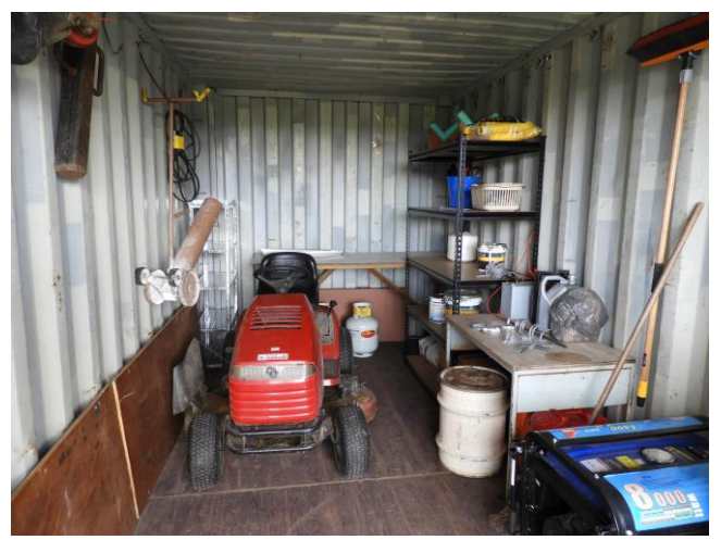
With the acquisition of the shelving unit, which we picked up at Bunnings on the day of the sausage sizzle, the container is now nicely organized with plenty of room to walk down past the mowers without tripping over something.