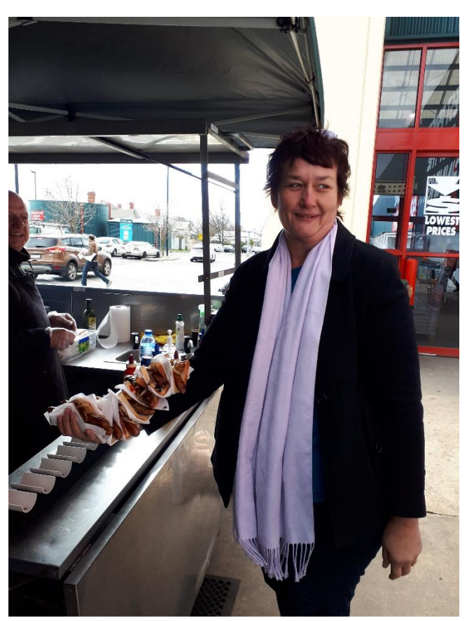
This lady was our best single customer and was quite insistent that she could manage 8 snags on her arm. I said to her "Can I get a photo of that?"