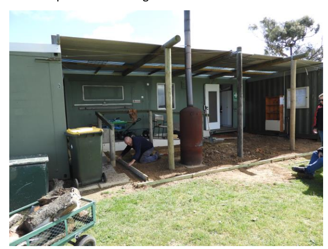
The retaining timber edge was moved out some 150mm to accommodate an even number of 450mm slabs. Originally 600x600 slabs were to be laid.

Last Sunday we started levelling the area in earnest ready for the pavers which are to be purchased following approval at the September meeting.