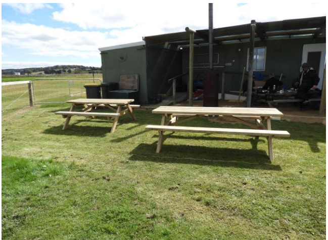
The new table/seats are a welcome addition to the field amenities.