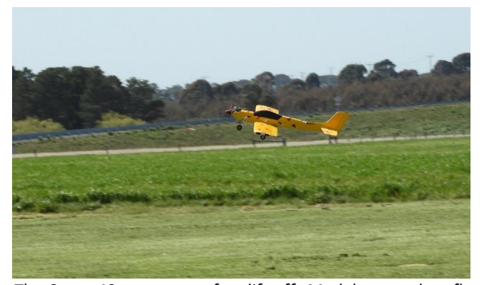
The Sport 40 moments after lift-off. Model seemed to fly quite well from an observer point of view.