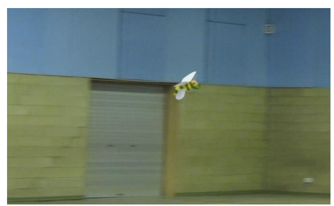
And off it goes in a circle that took it to the full width of the hall. Obviously perfectly trimmed to suit the hall.