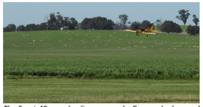
The Sport 40 on a landing approach. Graeme had several flights with it that day.