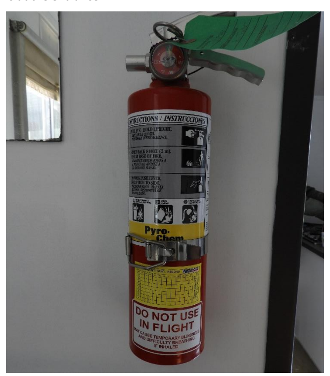
This one is located on the internal wall in the servery area.