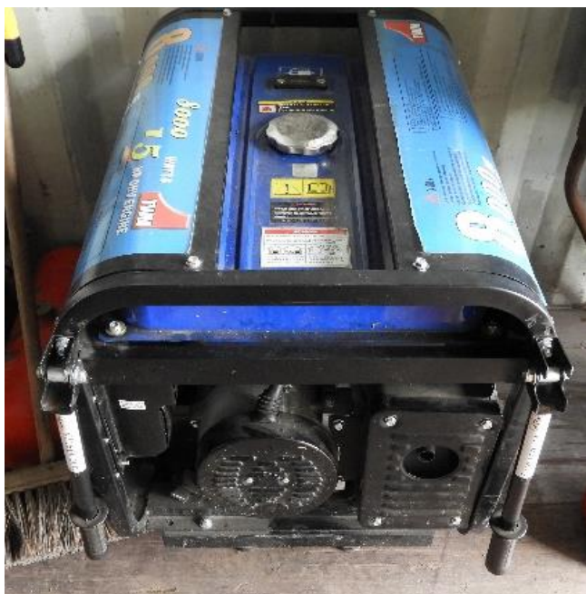
We came across a short length of aluminium tubing in the container during the cleanout and I used it to cut spacer blocks for the handles on the generator. Prevents the supports from collapsing inwards under load.