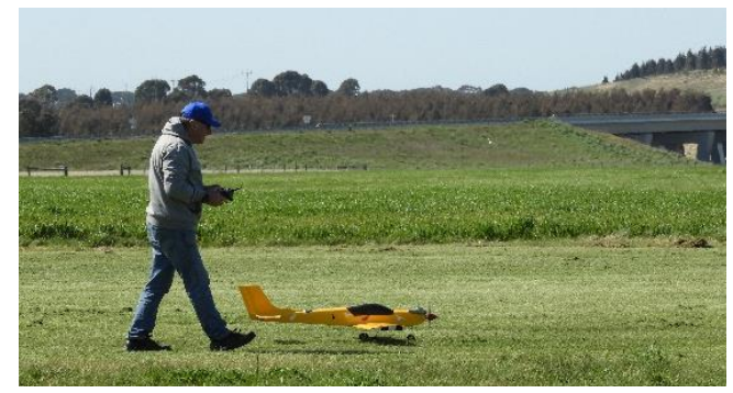
Taxiing out for take-off. I'm not sure if this was the maiden flight.