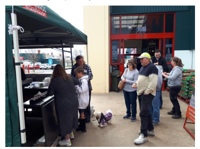
There were still plenty of busy times – quite often customers were queued up waiting to be served.

Many thanks to the members who were able to make it for their shift. I think it was an eye opener for those who haven't done it before just how busy it gets and that was a Friday. Between 10:30AM and 2PM it is full on.