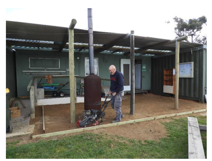
Murri on the whacker to compact the surface in readiness for the pavers. A bit more course fill is required along with fine blue stone dust to bed the pavers on.