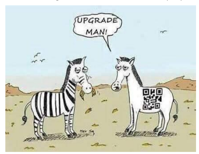
You might need a little help with this – the Zebra on the right has upgraded from barcode to QR code.

Two Thai girls asked a guy if he'd like to go bed with them; they said it would be just like winning Lotto! He agreed, and they were right. They all stripped off, and to his horror, they had six matching balls!!! Hmmm must've been lady boys.